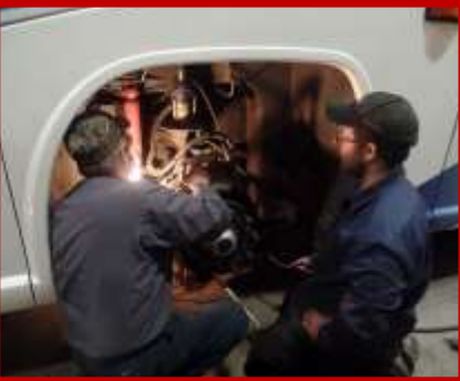
Diesel Tech - JOB SHADOW R & J Transportation - Sch. Haven