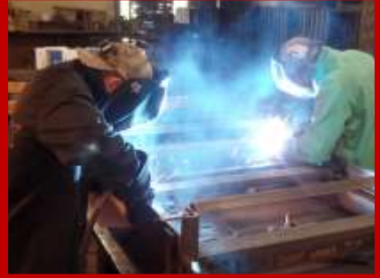
Welding - CAPSTONE Walco Manufacturing - Port Carbon