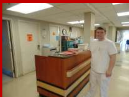
Health Careers - CLINICAL Manor Care - Pottsville