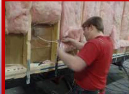
Res. & Ind. Electricity - CAPSTONE Pleasant Valley Homes - Pine Grove