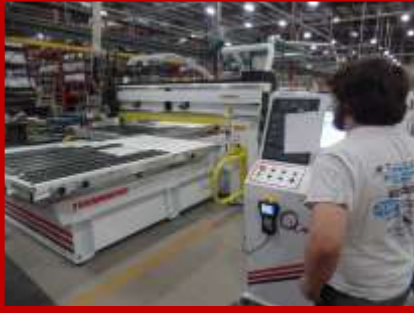
Pre-Engineering - CAPSTONE Highwood USA - Hometown